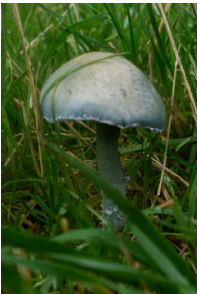
Stropharia caerulea (Blue Roundhead)