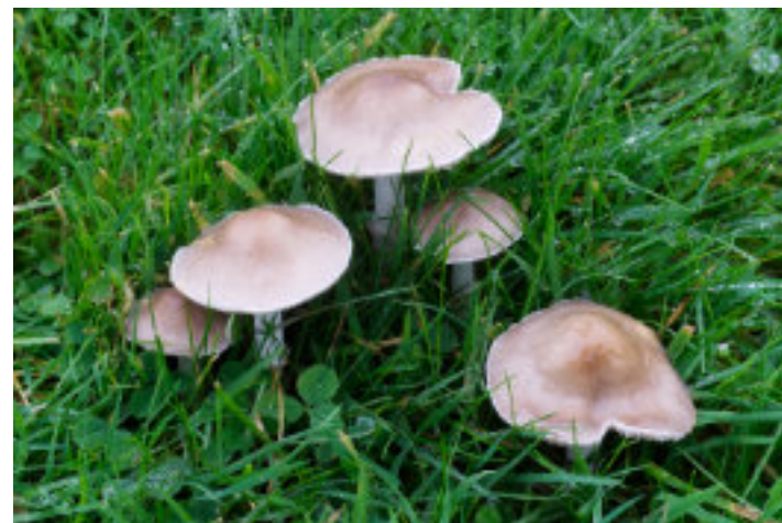
Cuphophyllus (Hygrocybe) virgineus var ochraceopallida