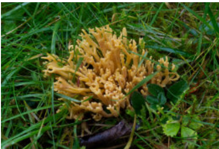
Clavulinopsis corniculata (Meadow Coral)