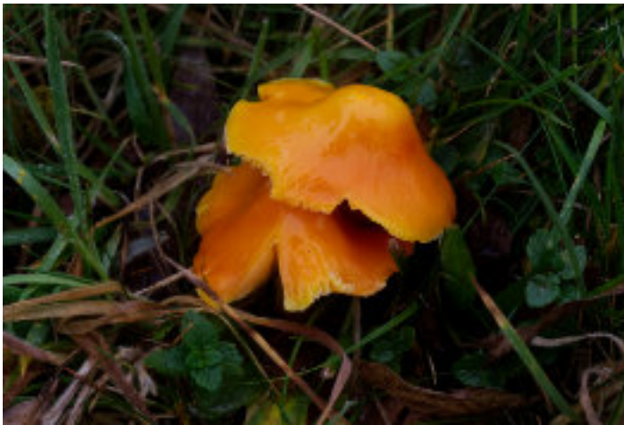
Hygrocybe aurantiosplendens (Orange Waxcap)