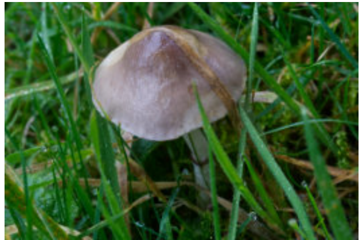
Gliophorus (Hygrocybe) irrigatus (Slimy Waxcap)