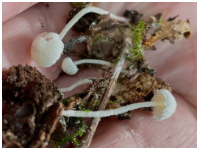
Mycena haematopus (lower right)