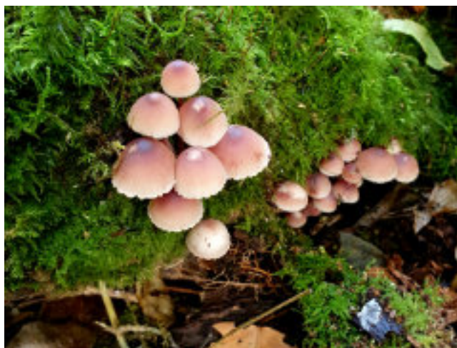
Mycena haematopus , readily identified from the “blood” that seeps from the stipe when broken