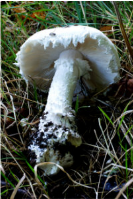
Amanita strobiliformis , a large robust species