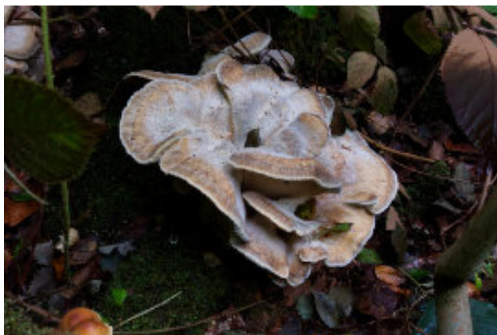
Meripilus giganteus : a cluster of the Giant Polypore, 40 cm across