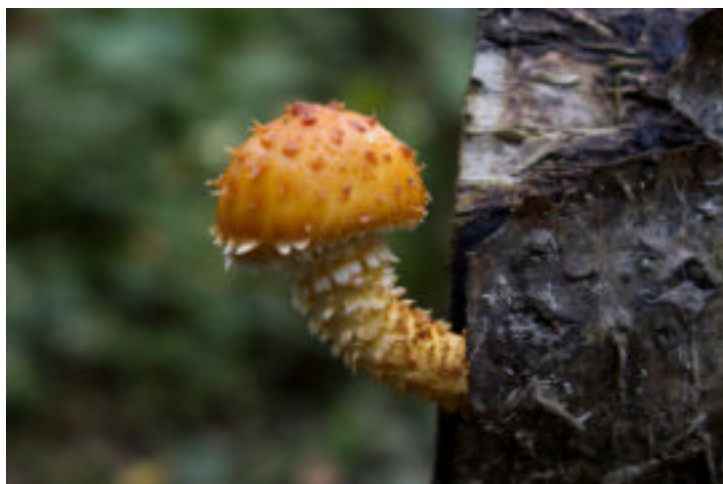
Pholiota adiposa , growing from the end of a felled tree