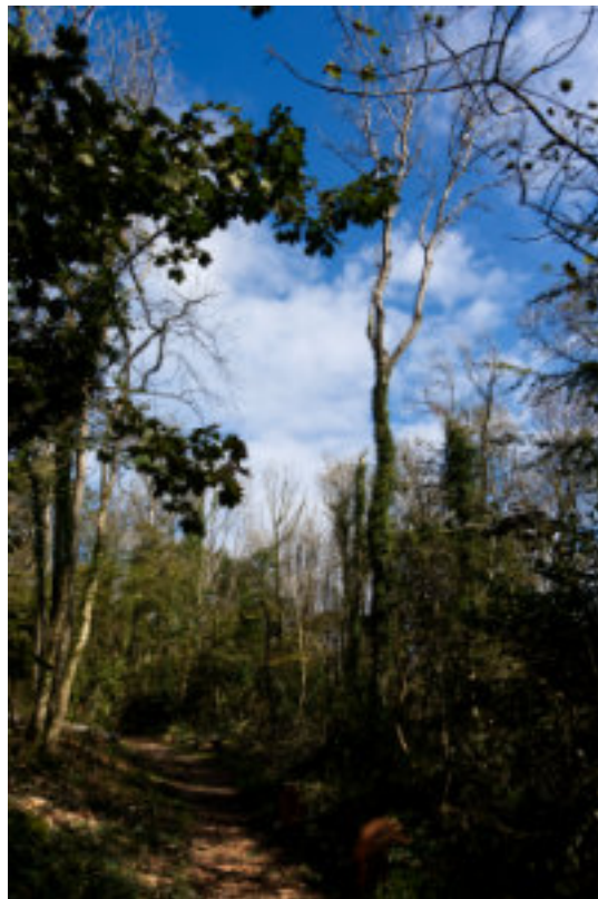
Ash Die Back causing devastation in a Quantocks Wood