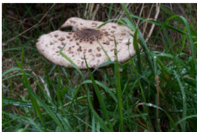
Macrolepiota procera , a Parasol Mushroom, common in longer grass